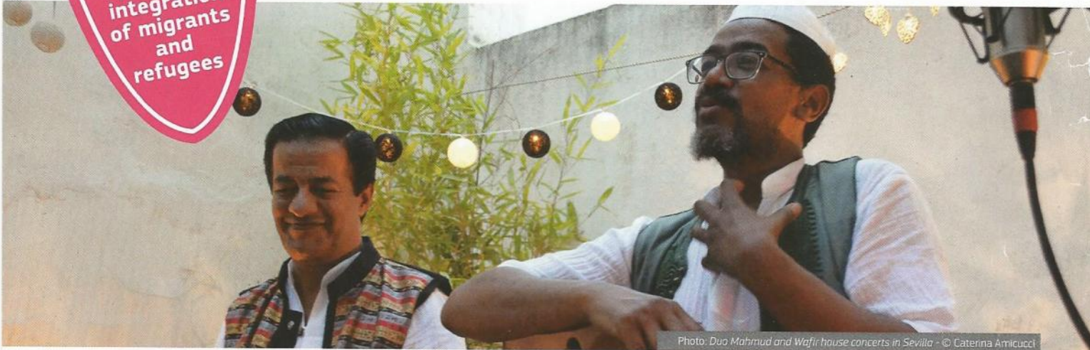
Photo: Duo Mahmud and Wafiq house concerts in Sevilla - © Caterina Amicucci

Special call integration of migrants and refugees